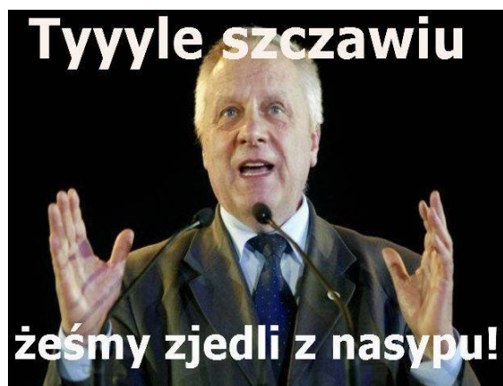
Pic. 20. 'Tyyyyle szczawiu' meme 35 .