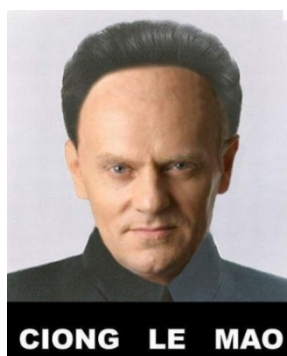
Pic. 9. 'Ciong Le Mao' meme 22 .