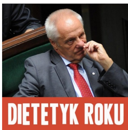
Pic. 21. 'Dietetyk roku' meme 36 .