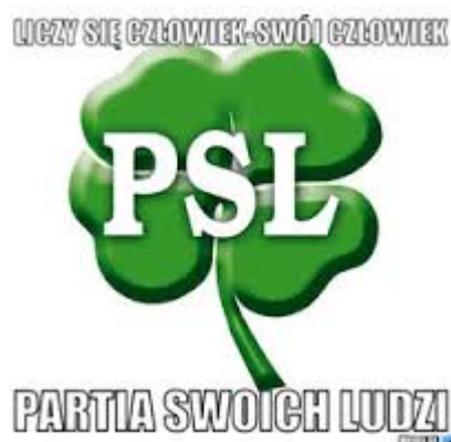
Pic. 28. ‘Partia Swoich Ludzi’ meme 49 .

trips to their relatives and acquaintances. The whole affair resulted in the dismissal of the Minister of Agriculture Marek Sawicki 47 . The scandal was described as “PSL 48 tapes” and generally the issue of nepotism in the Polish People’s Party evoked a strong reaction of the creators of Internet memes (pic. 28-29).