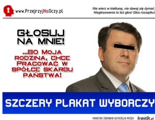
Pic. 29. ‘Szczery plakat wyborczy’ meme.