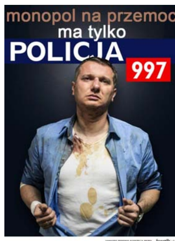
Pic. 17. 'Monopol na przemoc ma tylko policja' meme 30 .