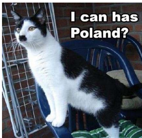
Pic. 2. 'I can has Poland?' meme.