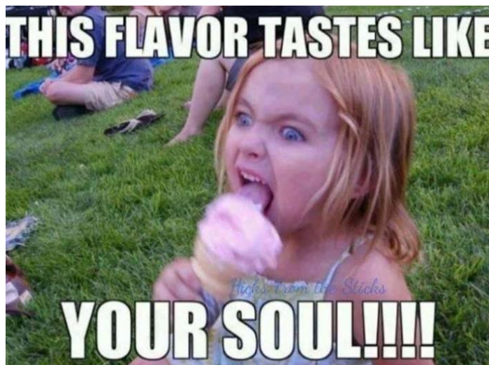
Pic. 1. 'This flavor tastes like your soul' meme.

tal photographs or pictures manipulated in computer programs, such as Photoshop 12 . Currently this exact form of an Internet meme seems to be the most popular – a digitally manipulated picture or photography, most frequently with a humorous phrase added on the top or bottom of it, or both 13 . A typical Internet meme is presented below.