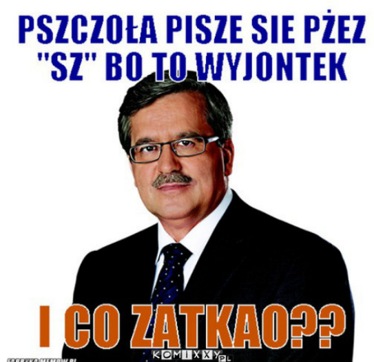
Pic. 18. 'Pszczola' meme 32 .