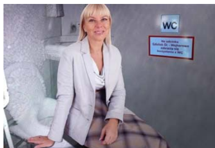
Pic. 7. Elżbieta Bieńkowska in train’s restroom meme.