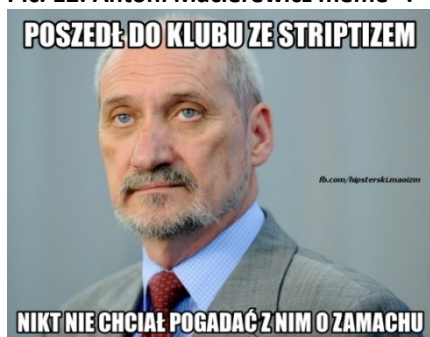
Pic. 12. Antoni Macierewicz meme 25 .

Source: rozrywka.dziennik.pl, 03.02.2014.