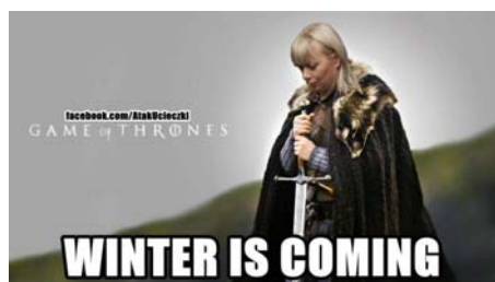
Pic. 5. ‘Winter is coming’ meme.