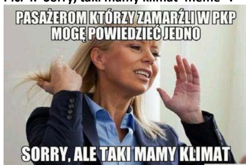
Pic. 4. ‘Sorry, taki mamy klimat’ meme 18 .

ry”, which in Polish has rather informal and in this case mocking character. The words may have sounded unfortunate and incorrect, especially concerning the fact they were said by the incumbent minister responsible for domestic railway communications. As a result, the reaction of the Internet users appeared very soon. Despite comments under news about the statement of minister Bieńkowska, many memes appeared as well (pictures 4-7).