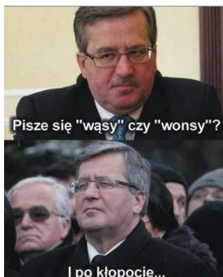
Pic. 19. 'Wąsy czy wonsy' meme 33 .