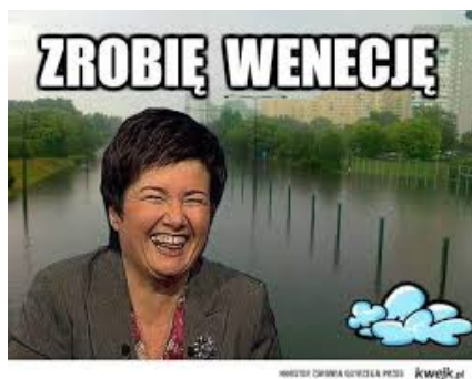
Pic. 24. 'Zrobię Wenecję' meme 41 .