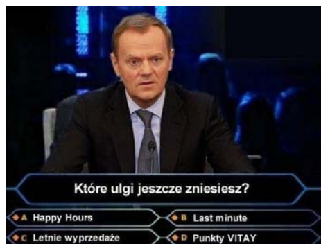
Pic. 8. 'Które ulgi jeszcze zniesiesz' meme 21 .

The situation above refers to a politician currently holding public office. Such a subject of Internet memes concerning Polish politics seems to be especially eagerly chosen by the authors of Internet memes. Individuals holding public offices are particularly exposed to criticism and mockery. Currently in Poland many Internet memes refer to the Prime Minister Donald Tusk (examples on pictures 8-11).