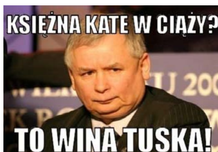
Pic. 13. 'Wina Tuska' meme 26 .