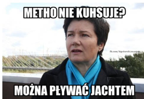
Pic. 25. 'Metho nie kuhsuje?' meme 42 .

Source: www.twojewiadomosci.com.pl, 25.01.2014.