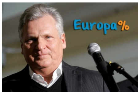
Pic. 22. 'Europa %' meme .