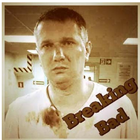
Pic. 16. 'Breaking Bad' meme.