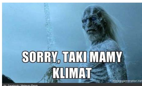
Pic. 6 19 , ‘Sorry, taki mamy klimat’ meme