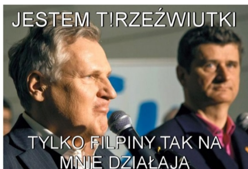
Pic. 23. 'Jestem t!rzeźwiutki' meme 39 .